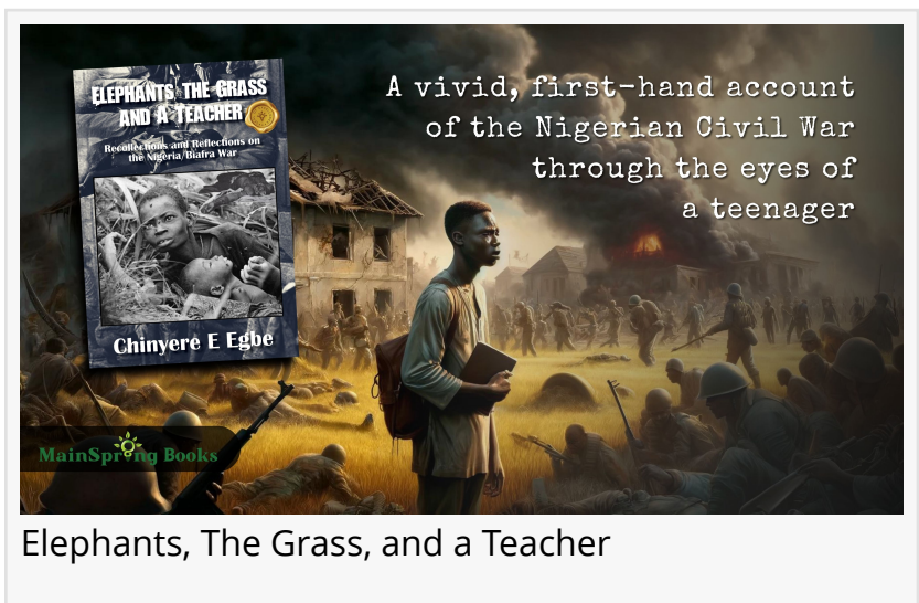
Elephants, The Grass, and a Teacher