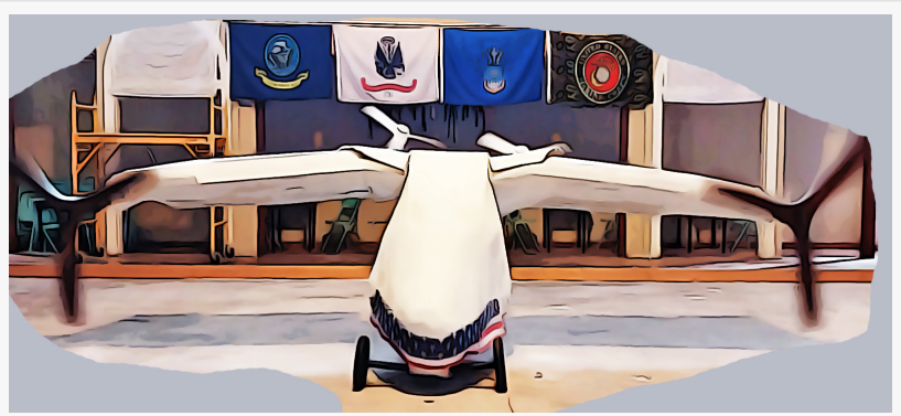
AeroTae propulsion testing

Industry forecasts predict that by 2040, AAM will become a multi-trillion-dollar sector, revolutionizing transportation and economic landscapes. Leading this transformation is McQueen, a trailblazer in aircraft certification and infrastructure development.