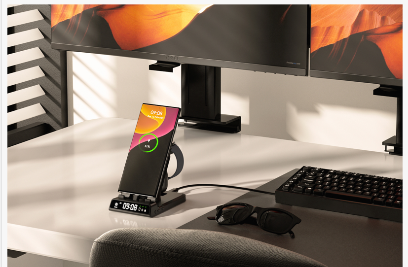
Two images showing wireless charging pads in use. The top image shows a white Apple Watch and a black iPhone charging on a sleek, black, rectangular wireless charging pad. The bottom image shows a black smartphone charging on a sleek, black, rectangular wireless charging pad on a white desk next to a computer monitor and keyboard.