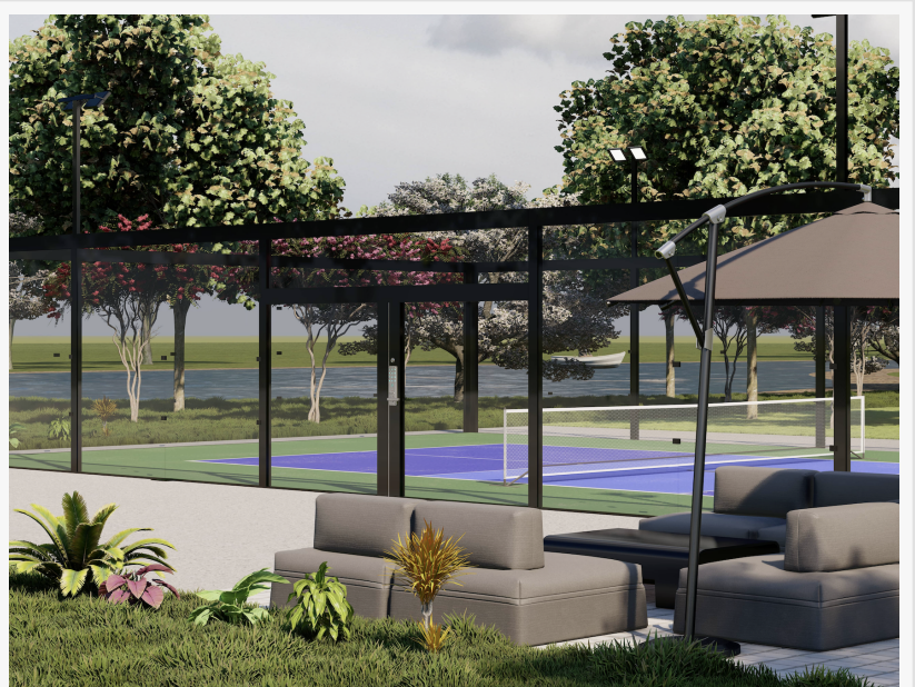
INFINITYGATE™ SAINT CHARLES COUNTRY CLUB, IL

disrupting the status quo with its advanced functionality, superior soundproofing technology, and sleek, contemporary design. PICKLEGLASS™ offers unparalleled features , including 50% sound reduction and a 360-degree panoramic glass enclosure, designed to transform the sports viewing experience. With robust galvanized SPHC steel columns and 1/2-inch explosion-proof tempered glass, it achieves a 50% noise reduction with an STC rating of 35, ensuring maximum safety and clarity. Additionally, PICKLEGLASS™ can withstand winds of 125-200 MPH, providing boundless panoramic views and vibrant, evenly distributed illumination through a curated 300W LED lighting system.