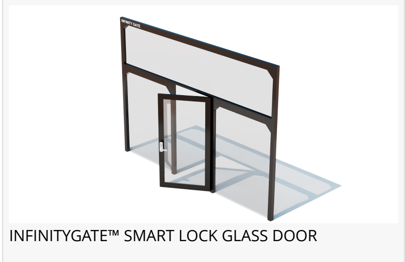
INFINITYGATE™ SMART LOCK GLASS DOOR