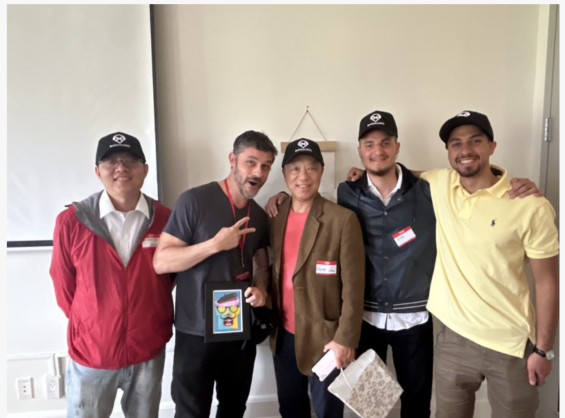
MetaDukes Strong Market Presence