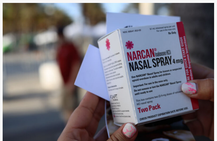
Narcan Boxes distributed by The Robin Foundation

This press release can be viewed online at: https://www.einpresswire.com/article/716711741