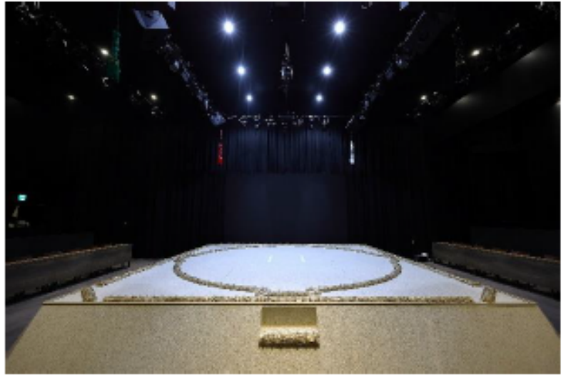
2. Dohyo (Sumo Ring)

We offer original bento boxes that reflect Japanese authenticity, along with options for premium bento, halal bento, and vegan bento. Experience Japan's traditional viewing culture of enjoying entertainment such as kabuki