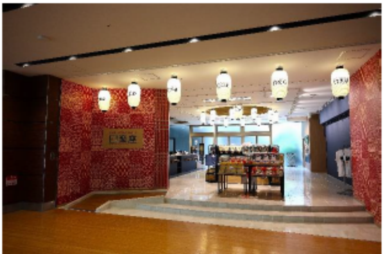
4. Gift Shop