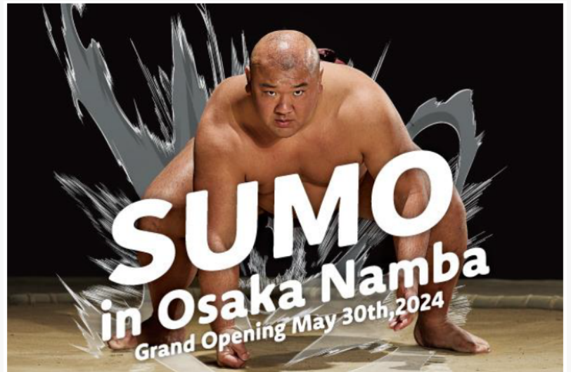
THE SUMO HALL HIRAKUZA OSAKA

In 2023, the number of inbound tourists to Japan has recovered to about 80% of pre-pandemic levels (2019), with a growing interest in experiential consumption, especially in Japan's unique traditional culture and cuisine. Despite the increasing number of foreign visitors seeking various attractions in Japan, the expenditure on "experiential consumption" remains lower compared to other countries,