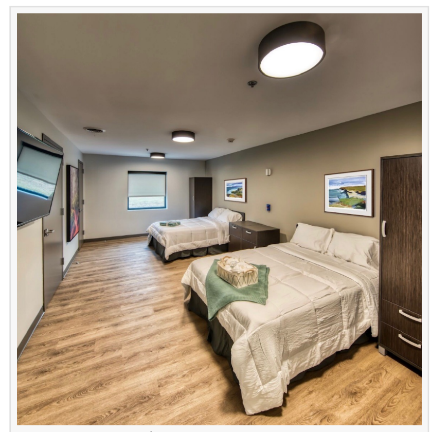
Innovo Detox Bedroom

This press release can be viewed online at: https://www.einpresswire.com/article/716846868 EIN Presswire's priority is source transparency. We do not allow opaque clients, and our editors try to be careful about weeding out false and misleading content. As a user, if you see something we have missed, please do bring it to our attention. Your help is welcome. EIN Presswire, Everyone's Internet News Presswire™, tries to define some of the boundaries that are reasonable