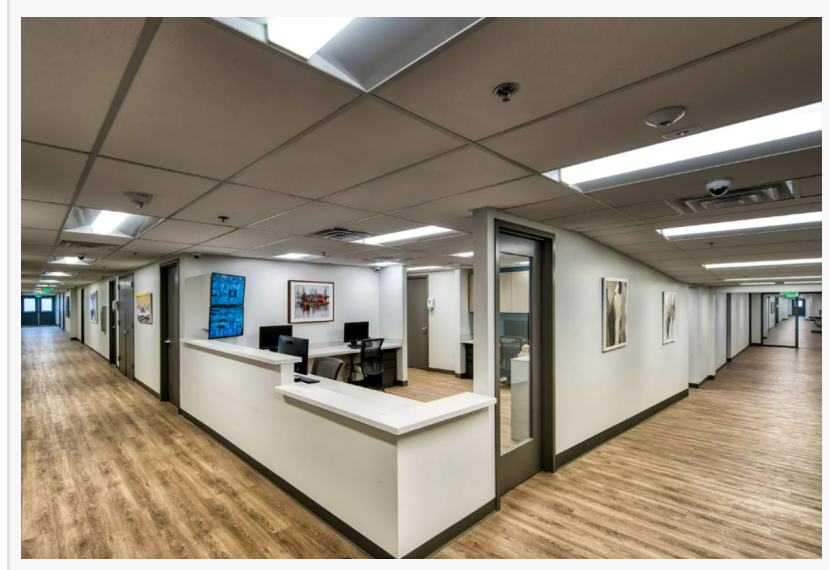
Innovo Detox Interior

Innovo Detox is a premier addiction treatment center located in Abbottstown, Pennsylvania. Our integrated approach to addiction and co-occurring mental health issues ensures that each individual receives the comprehensive care they need to achieve lasting recovery. From personalized detox programs to extended residential treatment, we are committed to providing the highest level of care in a safe and welcoming environment.