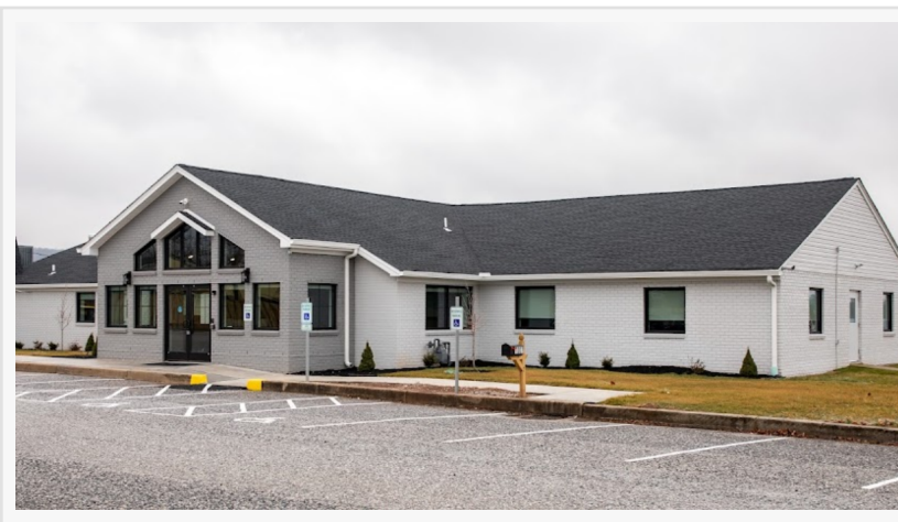
Innovo Detox Building