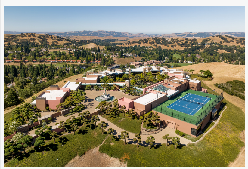
Blackhawk Country Club's exclusive Eagle Ridge