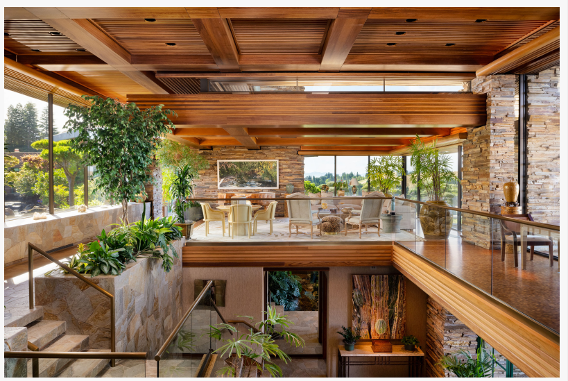
Gated hilltop property offering panoramic views and privacy

world spanning New York, Hong Kong, and Dubai.