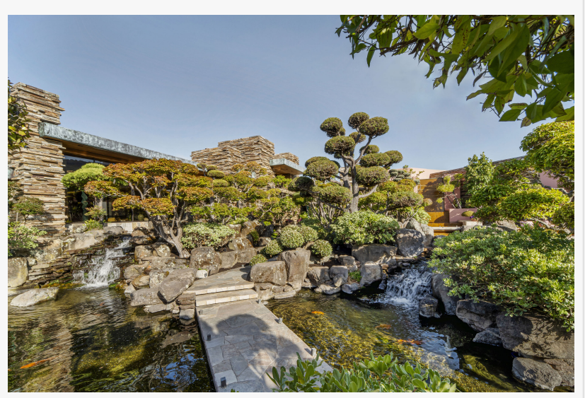
Terraced Japanese landscaping designed by Kimio Kimura