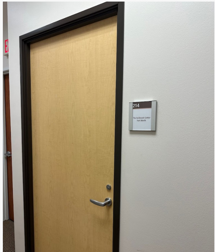
The Fullbrook Center Entrance