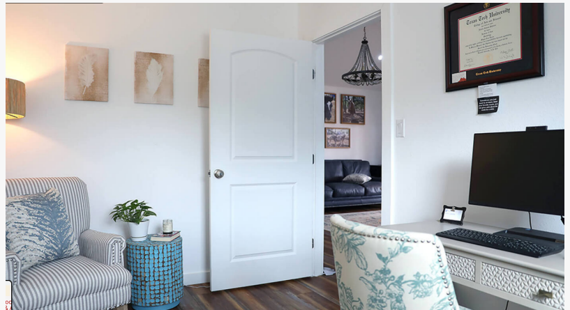
The Fullbrook Center Interior