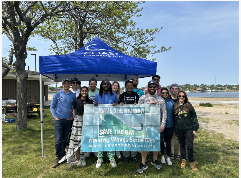
Malibu Beach Clean Up, Boston