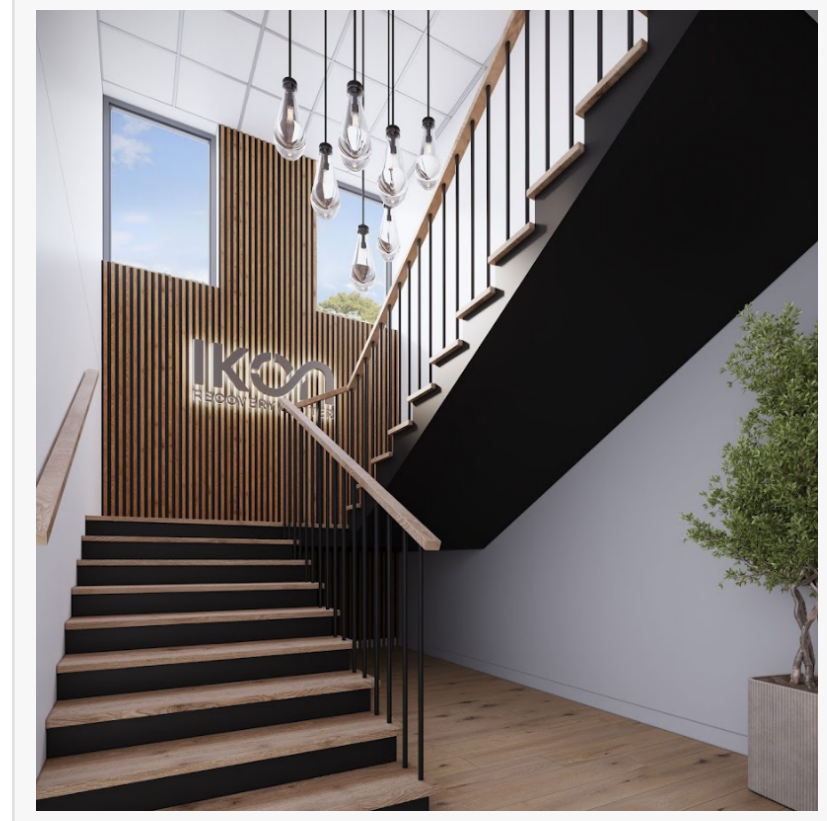
Ikon Recovery Entrance

About Ikon Drug & Alcohol Recovery Center New Jersey Ikon Drug & Alcohol Recovery Center New Jersey is a leading addiction treatment center located in <u>Saddle Brook</u>, NJ. Our mission is to provide comprehensive, evidence-based