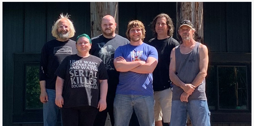
Nraakors Brand New Single Blood Sausage For Breakfast Out Now

Eulenspiegel Puppet Theatre captures this dualism in their video for the piece, setting up the struggle to carry on even when facing unknown dangers. Their visuals echo the musical stylings of the performance, capturing that uncertain moment that exists between slumber and harsh reality. It is a moment which is all too familiar these days, as we all labor to understand and survive the craziness of the world around us.