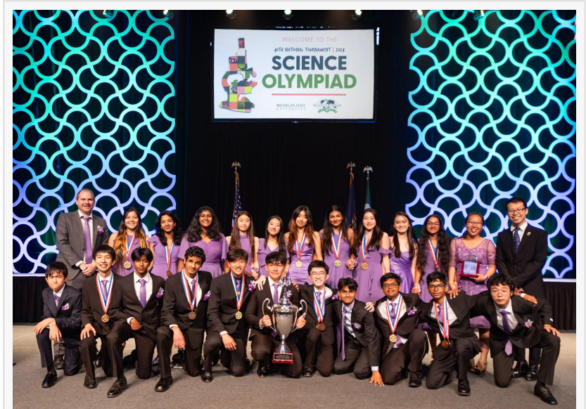
Monta Vista High School Crowned High School Champions at 40th Annual Science Olympiad National Tournament

This is the first time in Science Olympiad's 40-year history that Monta Vista High School has captured the title, and a back-to-back win for Kennedy Middle School.