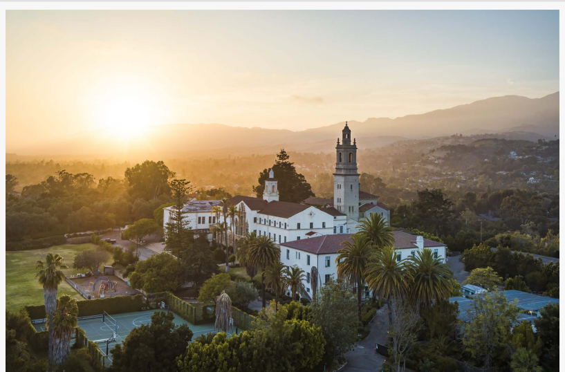
2300 Garden Street Santa Barbara, California