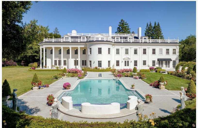
401 El Cerrito Avenue, Hillsborough, Silicon Valley, California