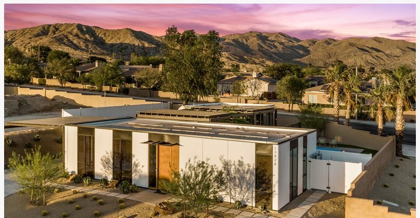
Scenic Crest Villas, Desert Hot Springs, Near Palm Springs, California