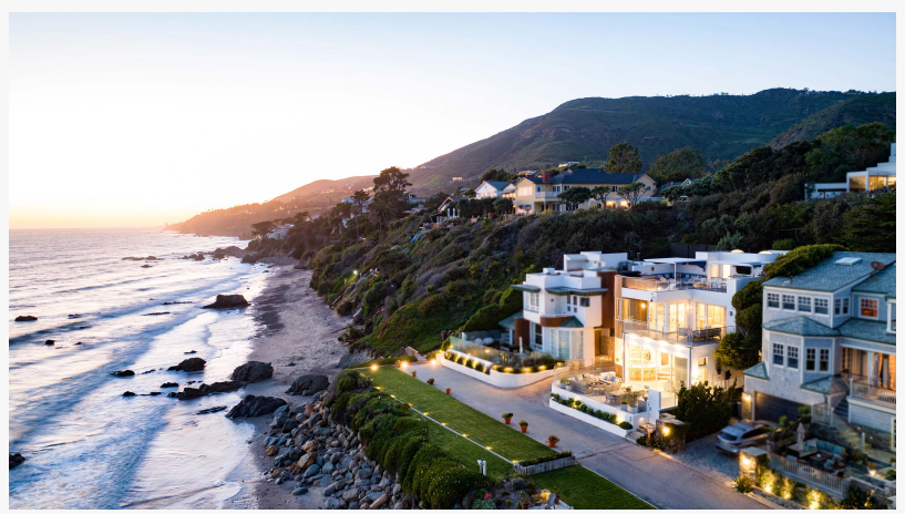
31721 Sea Level Drive, Malibu, California