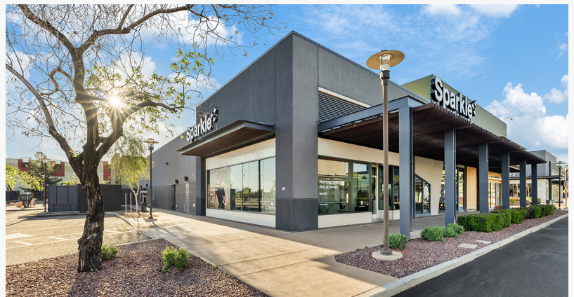
Salon exterior located at SanTan Village.