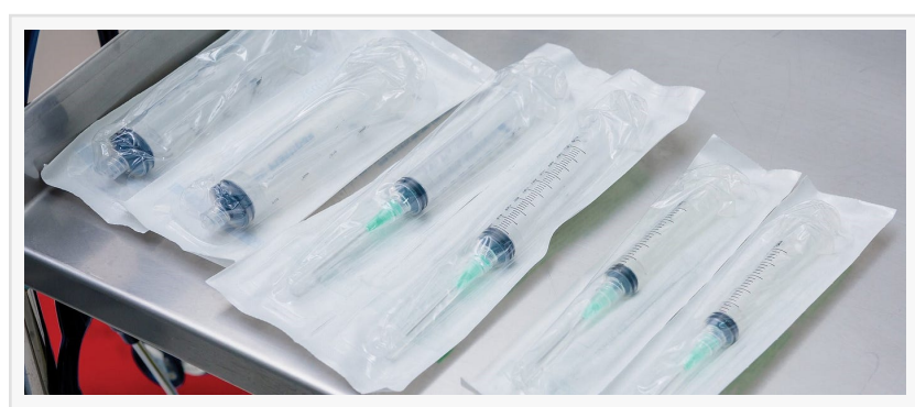
sterile medical packaging industry

LUTON, BEDFORDSHIRE, UNITED KINGDOM, June 4, 2024 /EINPresswire.com/ -- latest recently released a research report titled global Sterile Medical packaging Market insight, forecast to 2030, which assesses various factors influencing its