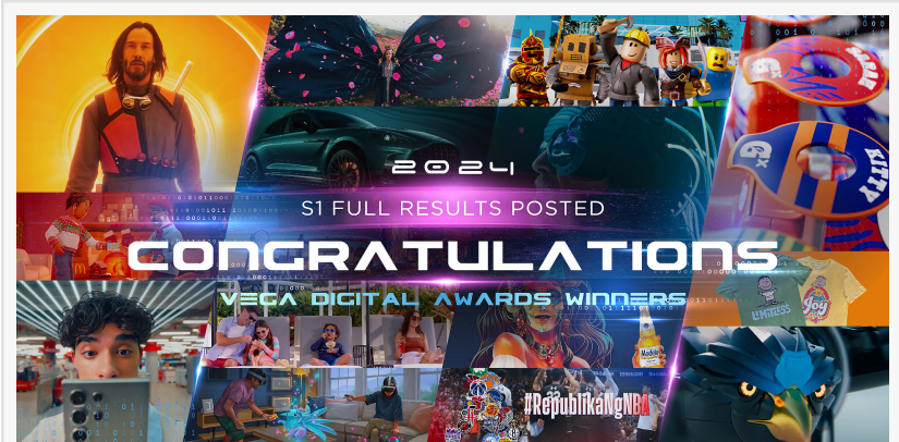
2024 Vega Digital Awards S1 Full Results Announced

This season, we welcomed a dynamic group of industry leaders as jurors to assess the submitted entries in the Vega Awards . These individuals bring a wealth of expertise and experience from leading digital enterprises to ensure a fair and insightful evaluation process, including Vice