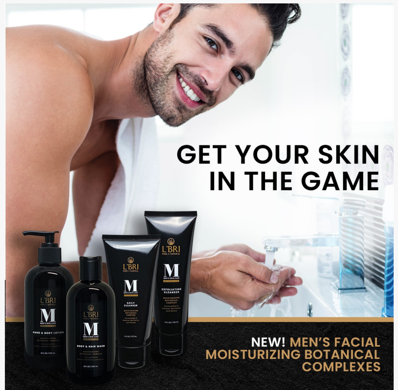
Skin and Body Care Set