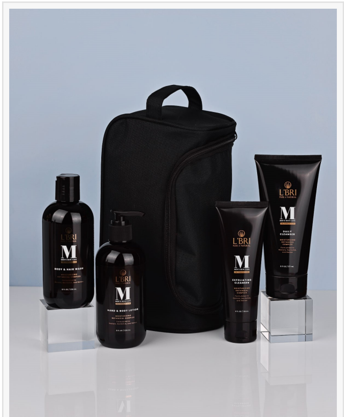
L'BRI Men's Father's Day Gift Set with Free Bag