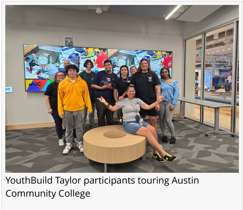
YouthBuild Taylor participants touring Austin Community College

AUSTIN, TX, UNITED STATES, June 7, 2024 /EINPresswire.com/ -- American YouthWorks' YouthBuild (AYW-YB) , a Pre-Apprenticeship program dedicated to supporting young people through education, job training, and leadership development, is proud to announce the launch of its newest operating site in Taylor, Texas. This expansion marks a significant step forward in the AYW-YB focus of offering valuable career training opportunities, expanding into