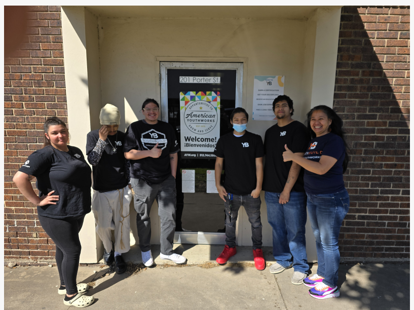
The inaugural YouthBuild Taylor cohort

In addition to academic and vocational training, the program places a strong emphasis on community engagement and participation in extracurricular activities and events. With a focus on continuous improvement and achievement, participants took their first Math GED test at the end of April, demonstrating their commitment to personal and academic growth.