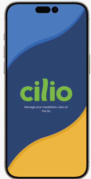
Cilio Mobile App

Moreover, it's not just the field teams benefiting from Cilio's innovative solution. The app also