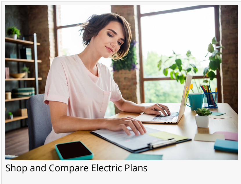
Shop and Compare Electric Plans

These offerings are particularly geared towards customers seeking business electricity plans in the dynamic Dallas electricity providers and Houston electricity providers markets.