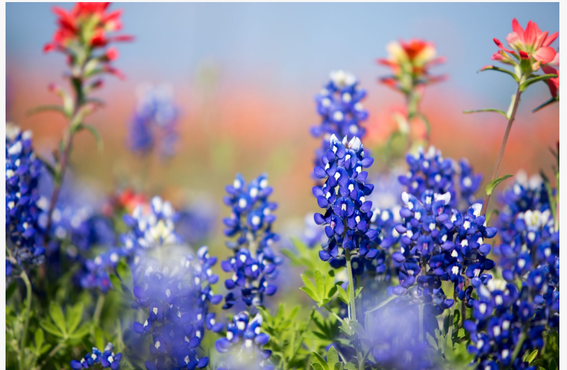
Texas Blue Bonnets