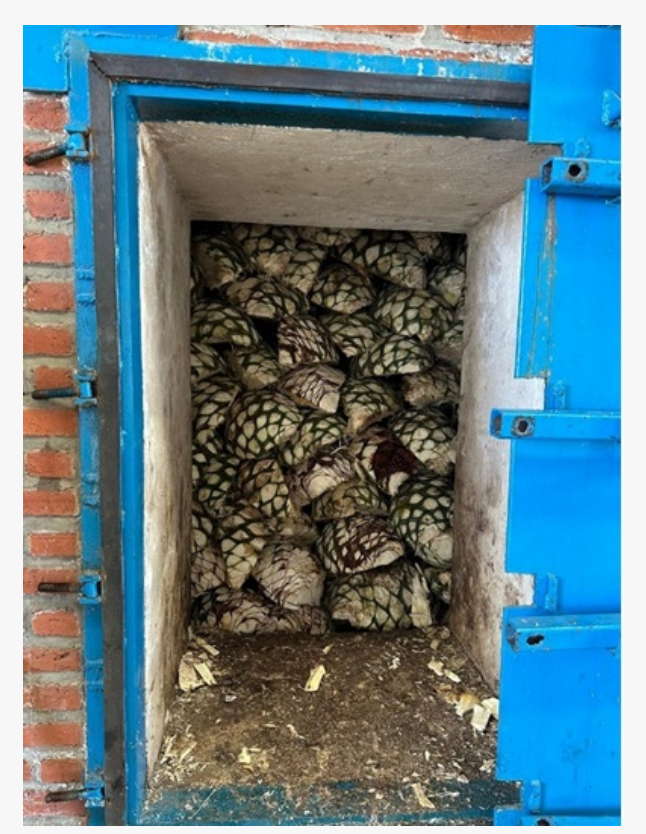
blue Weber placed in oven

This press release can be viewed online at: https://www.einpresswire.com/article/717286528