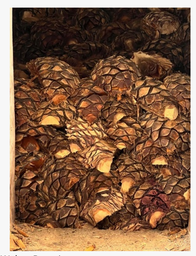
blue Weber Roasting

spirits market, delivering a level of quality that has been eagerly anticipated by connoisseurs.