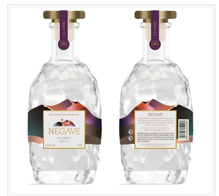
Negave Bottle Design

Negave's kosher certification is set to revolutionize the kosher spirits market, providing a premium option for consumers during Passover. Negave aims to fill the void in the high-end