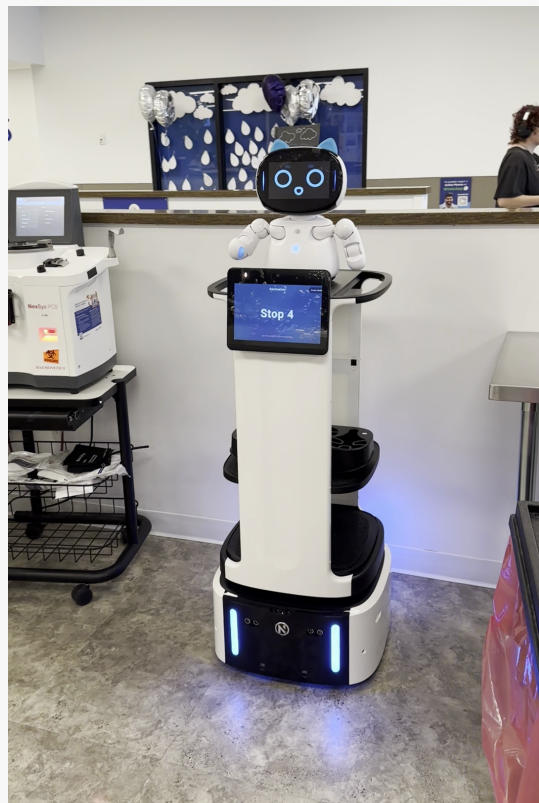
ColliBot - Medical Facility Delivery Robot