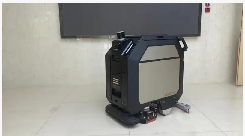
Scrubber 60 cleaning in a hospital

SB 525, signed into law last October, requires substantial wage increases for healthcare workers across California. While this legislation aims to ensure fair compensation for healthcare professionals, it also presents financial challenges for hospitals and medical facilities already operating within tight budget constraints. To address these challenges, healthcare providers are