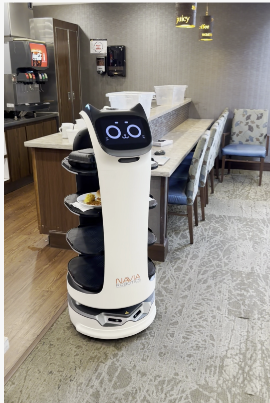
Bellabot making rounds delivering meals in the dining hall