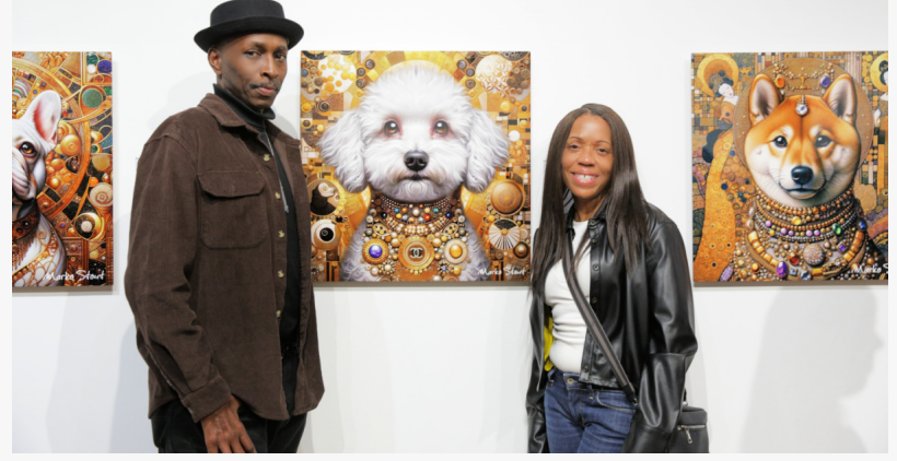
Marko Stout's fashionable 'Swag Dogs' light up the Anita Rodgers Gallery with a display of opulent dog portraits.

Canine couture takes center stage in Marko Stout's 'Swag Dogs' exhibition at Anita Rodgers Gallery