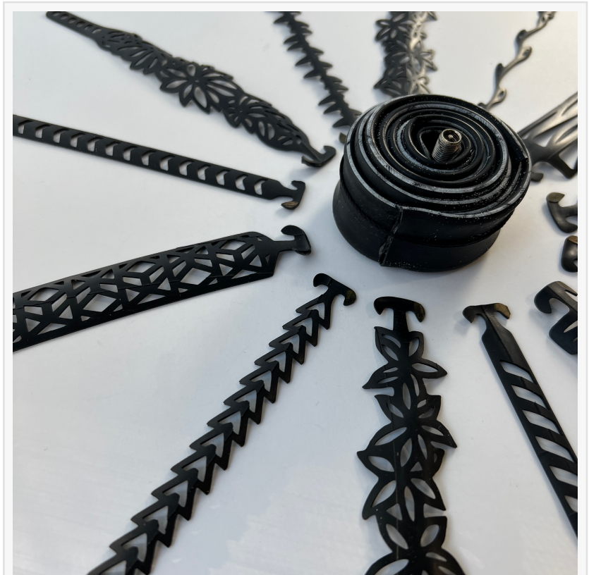
The Kaden & Kai Bicycle Tube Bracelet Collection

LEXINGTON, MA, USA, June 5, 2024 /EINPresswire.com/ -- Kaden & Kai , renowned for their innovative jewelry designs crafted from upcycled bicycle tubes, is set to make an appearance at the 2nd Annual Living Art Fashion Show in Boston, Massachusetts. The event is this Saturday, June 8, 2024, at the Boston Convention and Exhibition Center located in the Boston Seaport. Kaden & Kai will showcase their latest jewelry collection inspired by budding leaves, blooming flowers and creeping vines.