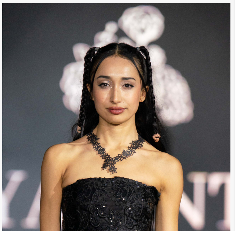
Kaden & Kai Daisy Bicycle Tube Necklace

This press release can be viewed online at: https://www.einpresswire.com/article/717347688