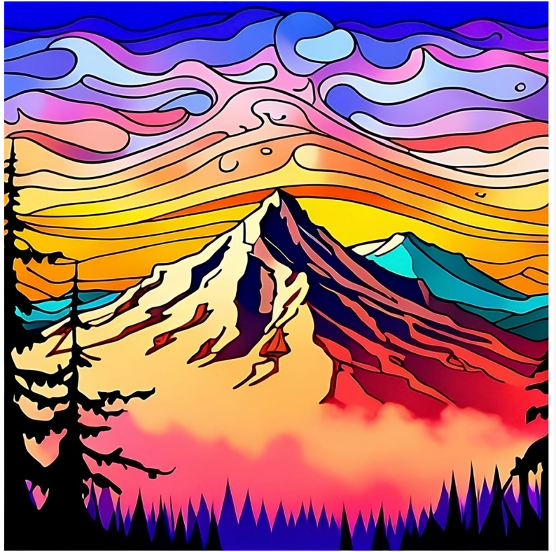
Mnt Mckinley interpreted with AI art.

This press release can be viewed online at: https://www.einpresswire.com/article/717358968