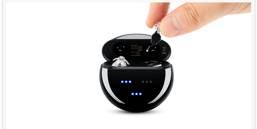
SmartU Rechargeable OTC Hearing Aids