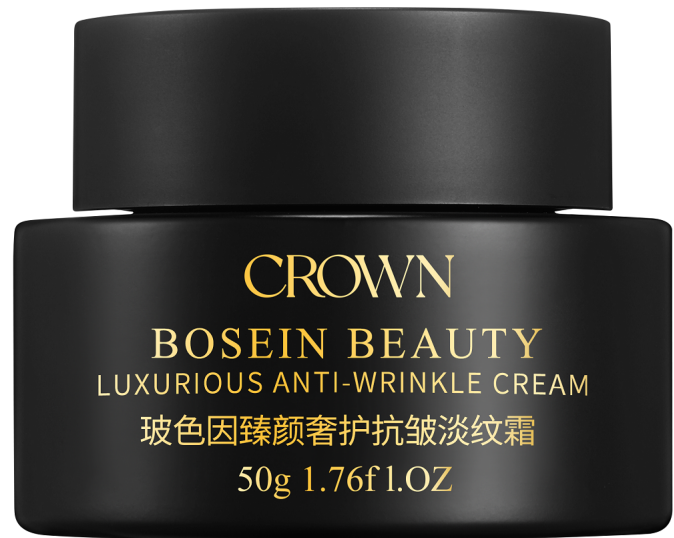
CROWN Bosein Beauty Luxurious Anti-Wrinkle Cream

CROWN's dedication to quality is evident in every aspect of its product development and manufacturing processes. By leveraging cutting-edge technologies and sourcing premium raw materials, CROWN ensures that each product meets the highest standards of excellence. The brand's commitment to innovation is further highlighted by