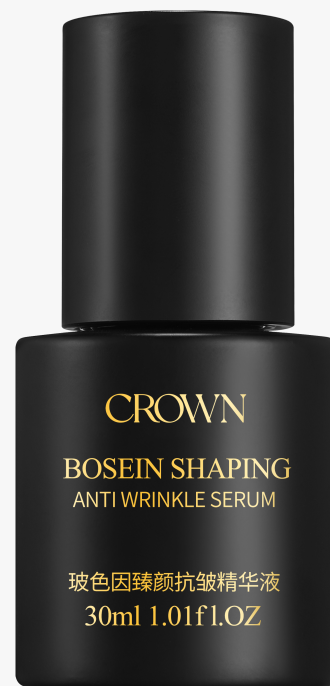
CROWN Bosein shaping Anti-Wrinkle Serum