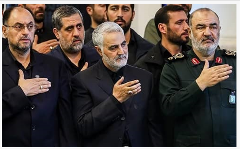
The Imam Ali Headquarters is another key location where Haghanian has long been active, earning a reputation among IRGC forces as a permanent fixture of the base, which has undergone numerous changes over the years while Haghanian remained.

According to state media, after security forces prevented the delivery of Habibi