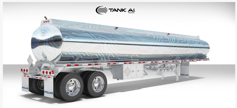
Polar Tank TANK Ai