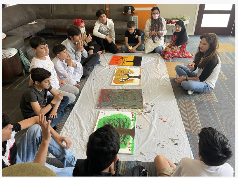
The Black Feather Foundation fosters a sense of teamwork as Afghan refugee children showcase their newly created artwork, discussing the importance of collaboration, leadership, and the challenges and joys of life in the USA.

An Afghan man falling from a plane into a burning city, depicting the harrowing experiences faced before the healing journey began. Created by an Afghan refugee child in EHC.