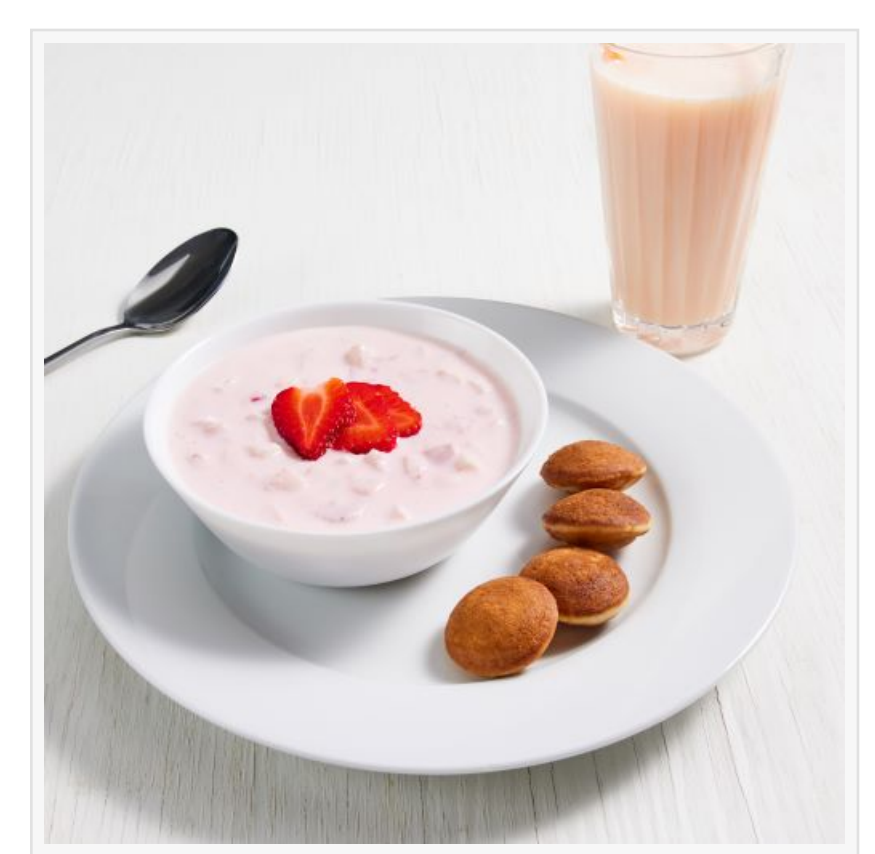
Vanilla Yogurt Parfait with Sweet Pancake Bites

Homestyle Direct is also pleased to announce more simplified meal prep tips and the new purple ribbon meal identifier to help cancer patients easily