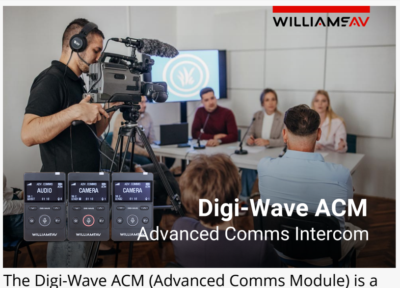
The Digi-Wave ACM (Advanced Comms Module) is a professional production intercom.

clear status indicators make it easy for admins to monitor. It also features automatic gain control for superior sound quality and intelligibility. The Digi-Loop 104 is perfect for venues looking to make meeting rooms, waiting rooms, reception areas, and assisted living facilities more inclusive for those with hearing loss and compliant with hearing legislation. more inclusive for those with hearing loss and compliant with hearing legislation.