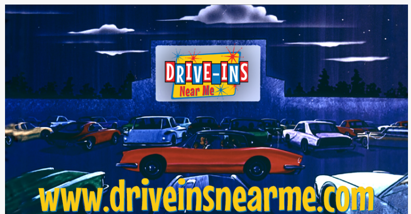
Drive Up and Sit Back for the Movie!