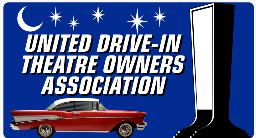
Honoring National Drive-In Movie Day

Designed and developed by Mobile Moviegoing, www.driveinsnearme.com is the first website run by outdoor Drive-in theatre owners that will house a comprehensive list of bona fide locations, in addition to the latest news