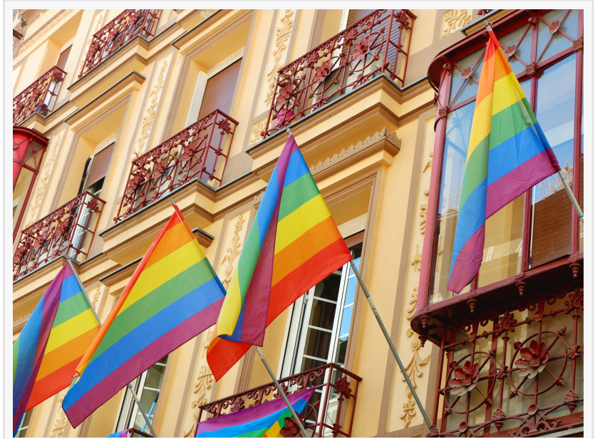
Pride flags on a building in Madrid City

Federico García Lorca, one of Spain's greatest poets, resonates deeply with the LGBTI community. His works explore themes of identity, love, and freedom, contributing significantly to literature and LGBTI rights. His "Poet in New York" delves into themes of isolation and the search for identity, reflecting the LGBTI experience.