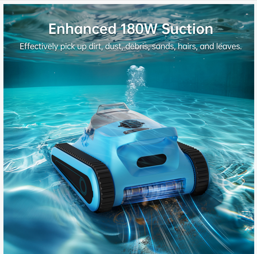
NexTrend 60V Pro Blue pool vacume cleaners