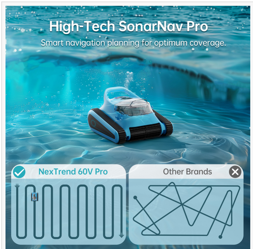
NexTrend 60V Pro Blue above ground pool vacuum

2. Energy and Cost Savings: Despite its high-performance delivery, this vacuum operates with energy efficiency in mind and offers long-term cost savings by lessening the wear on traditional pool systems.