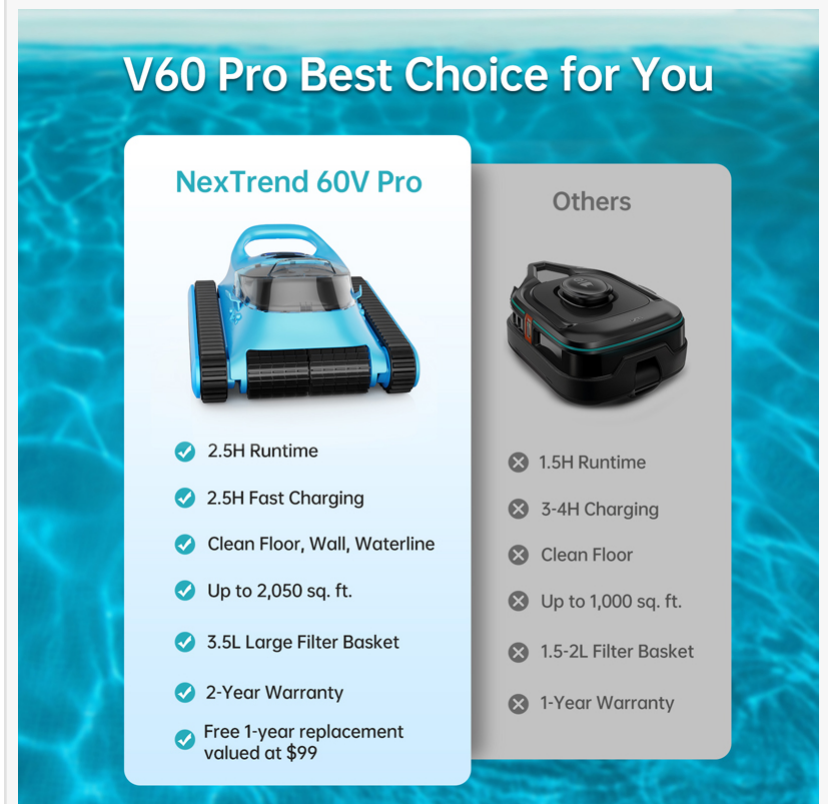
NexTrend 60V Pro Blue Cordless Pool Vacuum Robot