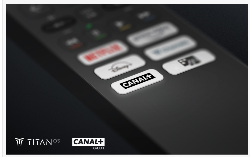
Titan OS Canal Plus Remote Control Button

CANAL+ Group applications will be pre-installed on Titan OS Home Page, allowing CANAL+ Group subscribers to log-in and enjoy the best sports, movies, or series content.