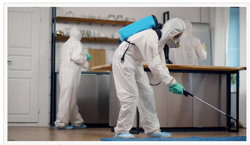
Pest Control Business

Global "Pest Control Market" Research report is an in-depth study of the market Analysis. Along with the most