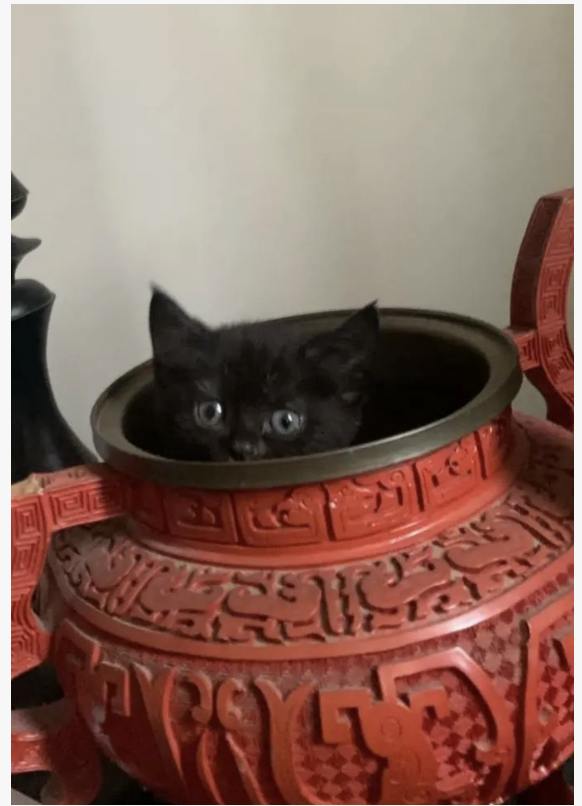
Patches as a kitten