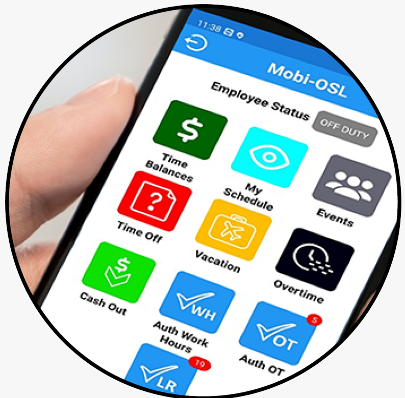
Mobi-OSL for smartphone scheduling and staffing functions