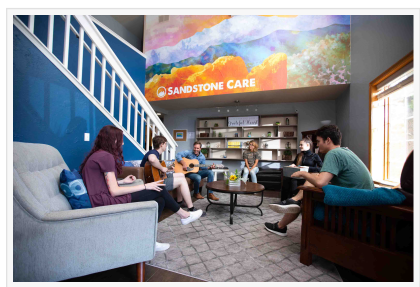
Cascade Canyon Teen Residential Common Area

CASCADE, COLORADO, UNITED STATES, June 6, 2024 /EINPresswire.com/ -- Cascade Canyon, a leading mental health and substance use treatment center located in the Rocky Mountains outside Colorado Springs, is dedicated to offering the best care available for teenagers. Under the expert guidance of Amanda Porter, LPC, LAC, the center provides a range of services, including a Teen Residential Treatment Program