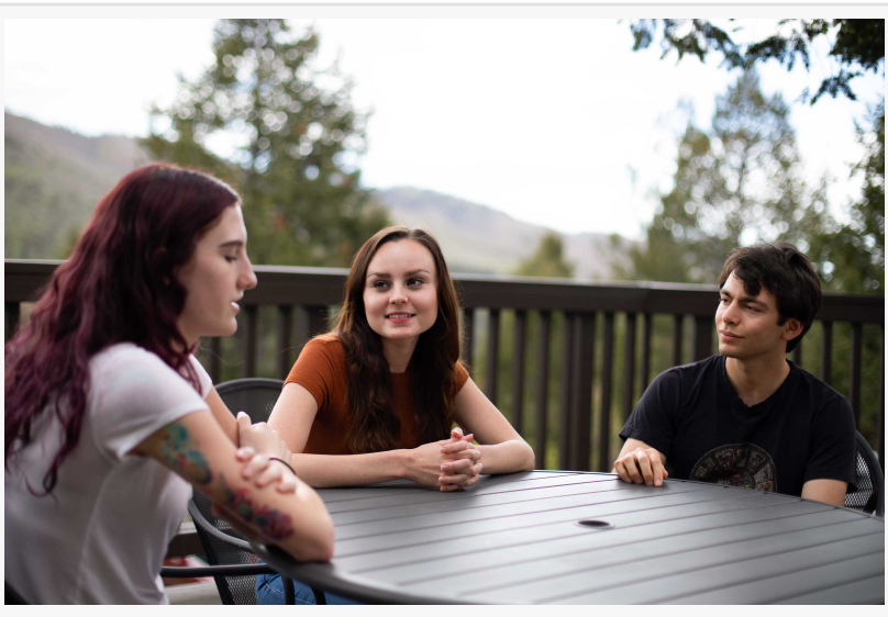
Cascade Canyon Teen Residential Group Therapy

Cascade Canyon stands out for its agespecific care tailored to the unique challenges faced at different life stages. By using evidence-based therapies and