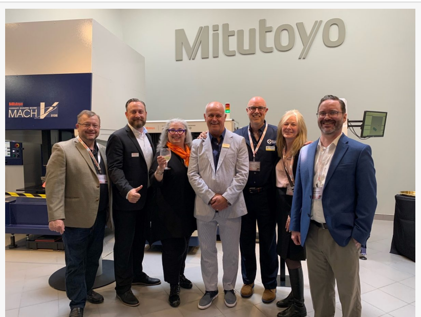
KBC, CTMA, and Mitutoyo at Mitutoyo Canada's 50th anniversary party

Clients can peruse online or in person what's new, hot, and in demand in industry to get the job done with precision, speed, and economy. Some clients often travel from great distances to see