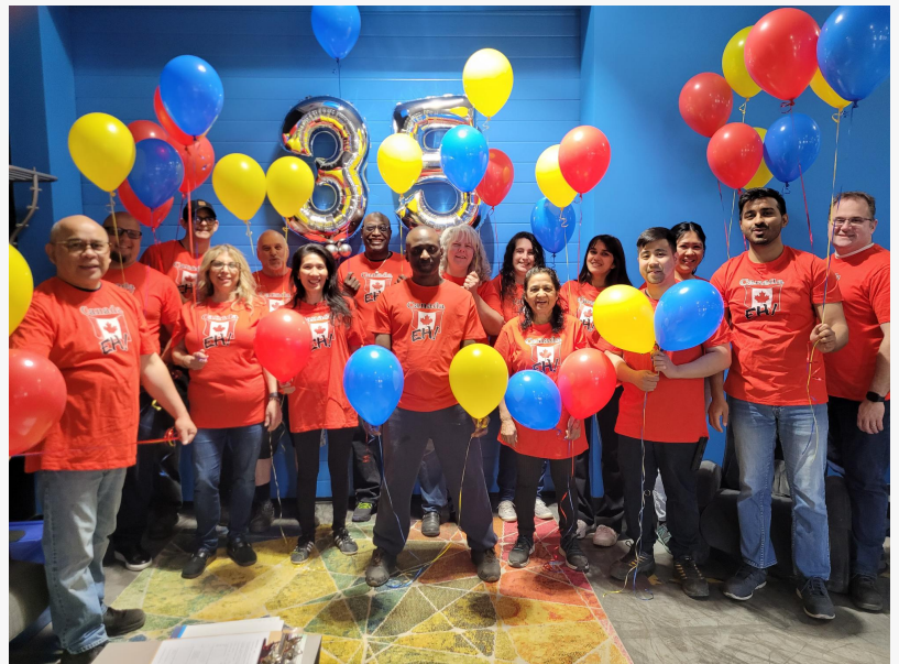
Team KBC celebrates KBC's 35th Canadian anniversary