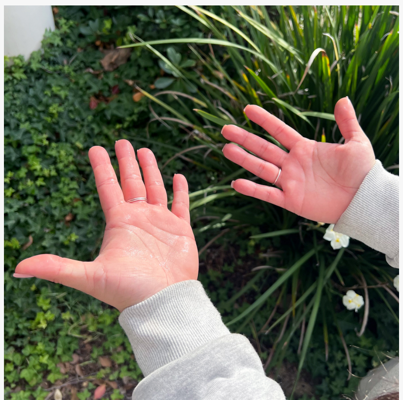
Sweaty hands could be palmar hyperhidrosis

MOORPARK, CA, USA, June 11, 2024 /EINPresswire.com/ -- As summer temperatures rise, many parents are noticing excessive sweating in their children that goes beyond typical warm weather perspiration. While some sweat is normal, constantly dripping hands, feet, and underarms could be a sign of hyperhidrosis , a medical condition causing excessive sweating. This condition affects millions of children and can take a toll on self-esteem, mental health, and future aspirations.