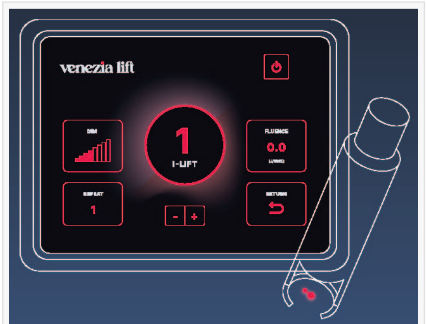
Venezia Lift User Interface