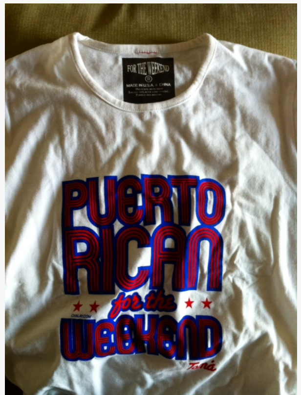
Puerto Rican For The Weekend Smpl Tee