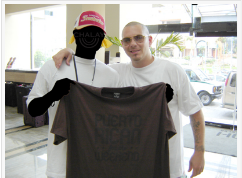
evOLVE & Pitbull chillaxing For The Weekend

NEW YORK, NY, USA, June 7, 2024 /EINPresswire.com/ -- CHALAY - In the cultural mecca of New York City, people from all walks of life often come together to experience each other's unique heritage. From the Puerto Rican Day Parade to the West Indian Day Parade to the St. Patrick's Day Parade, etc. The cultural line is often blurred as people celebrate diversity and unity.