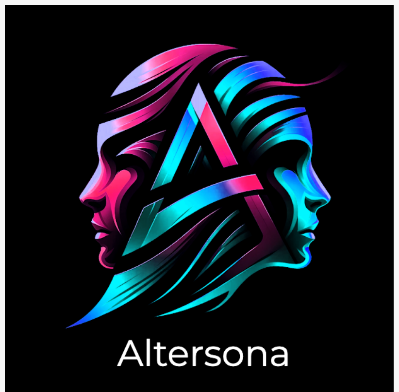
Altersona.com - real people, alternate identities

"We recognize the importance of privacy and freedom of expression," say the founders of Altersona. "Our platform is designed to facilitate honest conversations through videos, without the burden of judgment or repercussions. We're thrilled to see individuals from all walks of life,