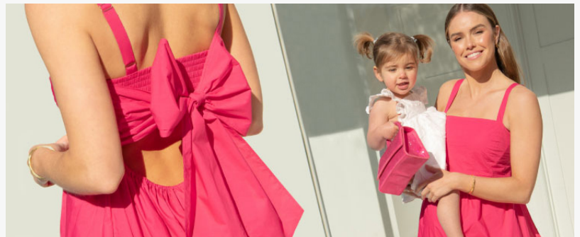
Tamara Maternity Dress