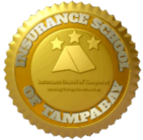
Seal of Learning

This press release can be viewed online at: https://www.einpresswire.com/article/718198355